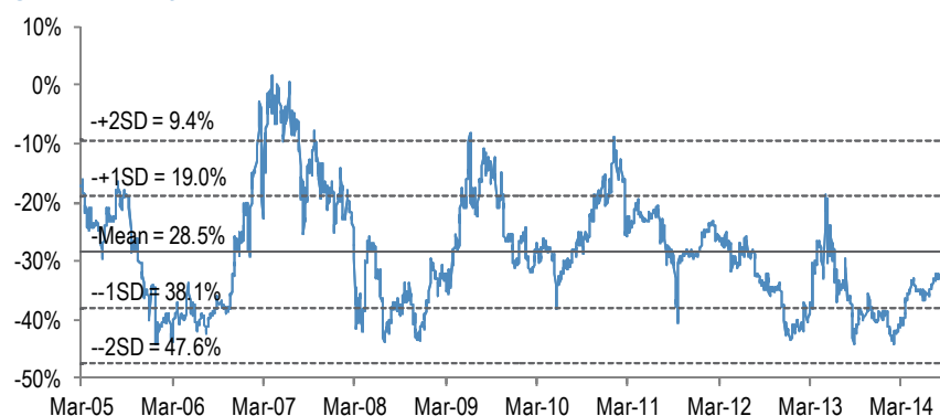
Figure 1: Property sector RNAV band